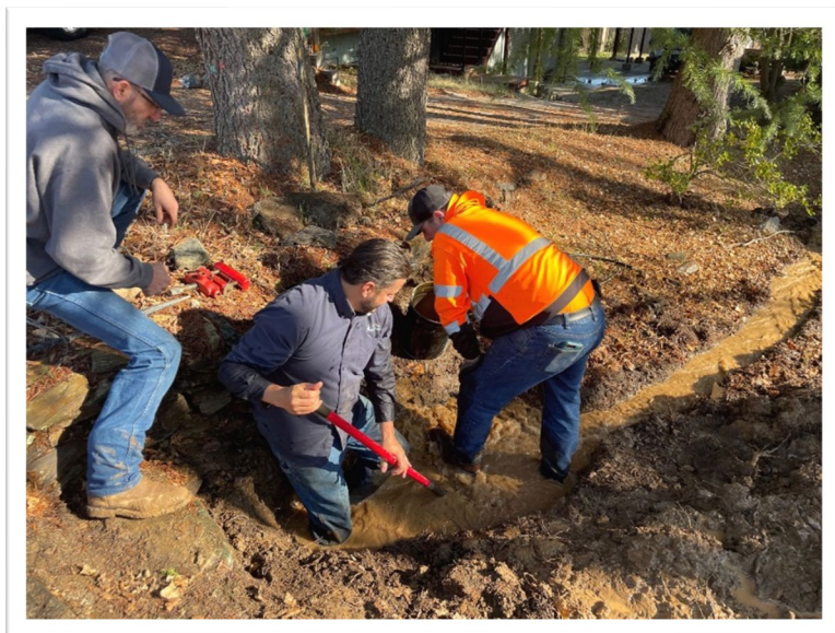
Water Break - Mt Jefferson